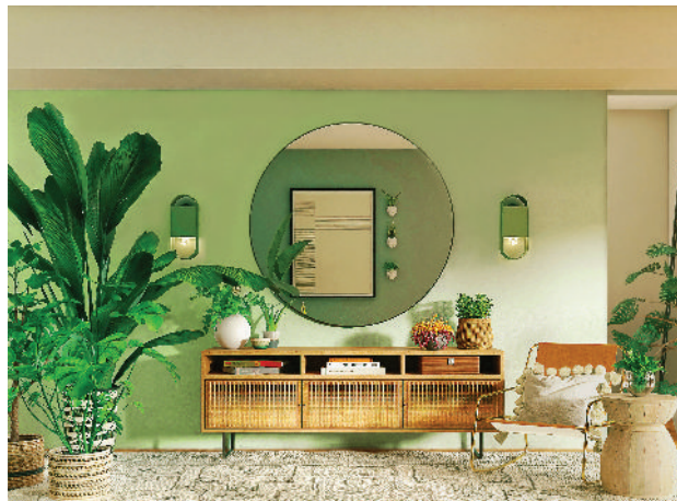
Left Wall Mint Green 19-684-W Right Wall Lemon Drop 19-226-W