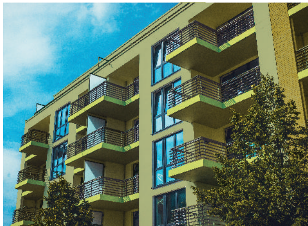
Walls Soft Green 19-613-W Trim Mustard 19-610-W