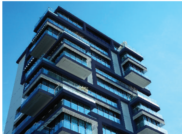
Walls Faraway Blue 19-714-W Trim Grape Jewel 19-784-W

Colors may slightly vary from the actual color chips shown.