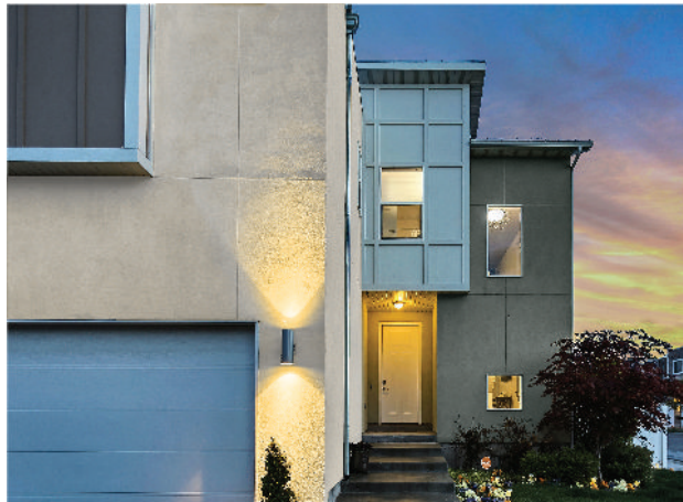
Left Wall Laguna White 19-101-W Right Wall Silver Gray 19-850-W