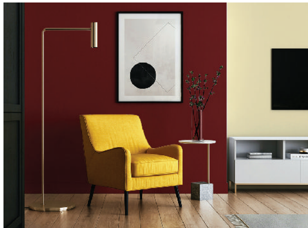
Left Wall Tile Red 19-370-W Right Wall Bleached Lime 19-233-W