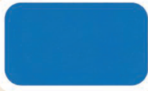
CRYSTAL BLUE (63-787-AK)