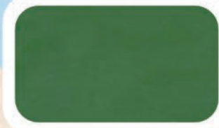
SAFETY GREEN (63 -630-AK)