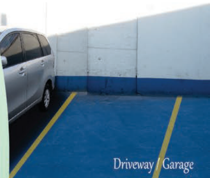
Driveway / Garage