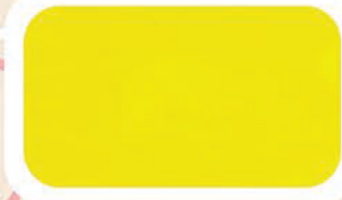
SAFETY YELLOW (63 -204-AK)